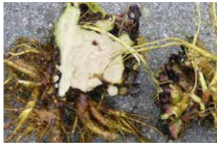
Rodhiola rosea Golden root Root